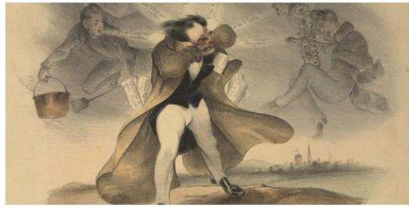
Excerpt from A Aix, à Marseille, à Lyon, à Toulouse, à Bordeaux, à Angers, partout, partout, partout. Honoré Daumier Digitized Lithographs collection.

Welcome to the Brandeis Institutional Repository, established in 2008. The Brandeis Institutional Repository is a resource for the Brandeis community to showcase, organize, share, and preserve research and scholarship in an Open Access repository.