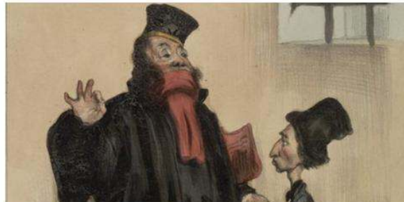
Excerpt from Robert Macaire avocat. Honoré Daumier Digitized Lithographs collection.

Welcome to the Brandeis Institutional Repository, established in 2008. The Brandeis Institutional Repository is a resource for the Brandeis community to showcase, organize, share, and preserve research and scholarship in an Open Access repository.